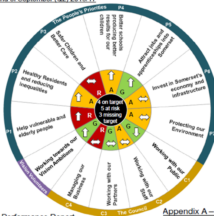
Appendix A – Corporate Performance Report End of December 2016/17